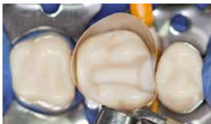
A fully prepared cavity