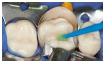
Coating of the cavity walls with Futurabond DC