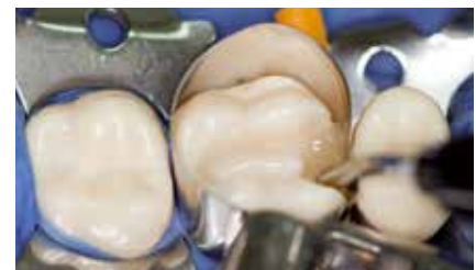
Start at the deepest point in the cavity ...